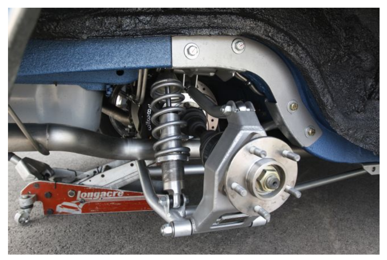
The Heidts IRS is a work of art, providing show-quality looks with race-car performance. And when combined with the IFS, it can bring any 1964 1/2-1970 Mustang into the 21st century.

While I was hoping for a little oversteer to help it rotate on the tight autocross, the balance was more neutral, which is better for bigger tracks and sweeping corners. The team had the shocks in a stiffer setting, and even so, the ride quality was comfortable. A few clicks on the shocks would soften the ride for everyday driving.