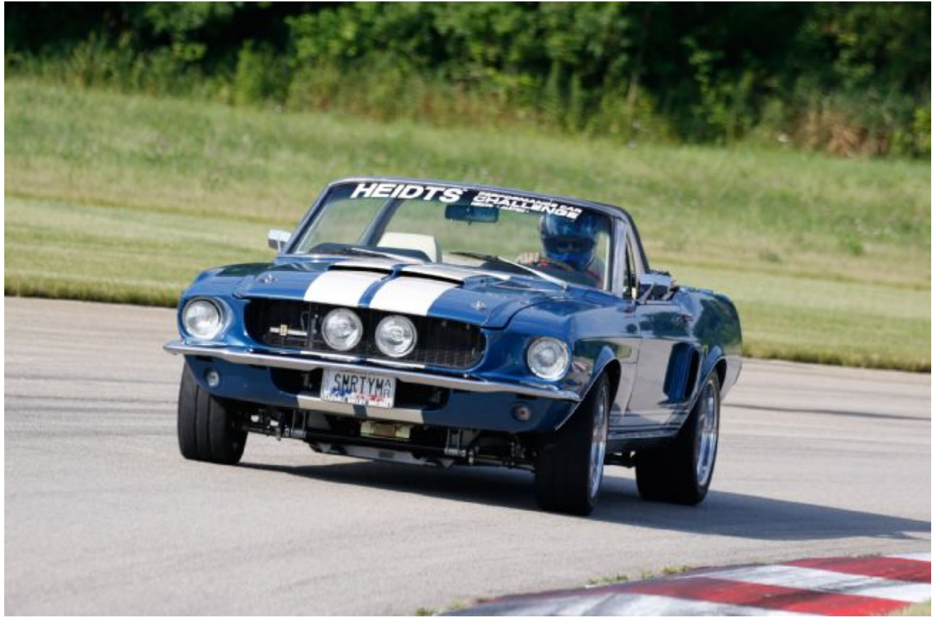
The cornering is flat with a neutral balance.

In addition to world-class performance, the Heidts' Project Shelby has a wicked-cool stance.