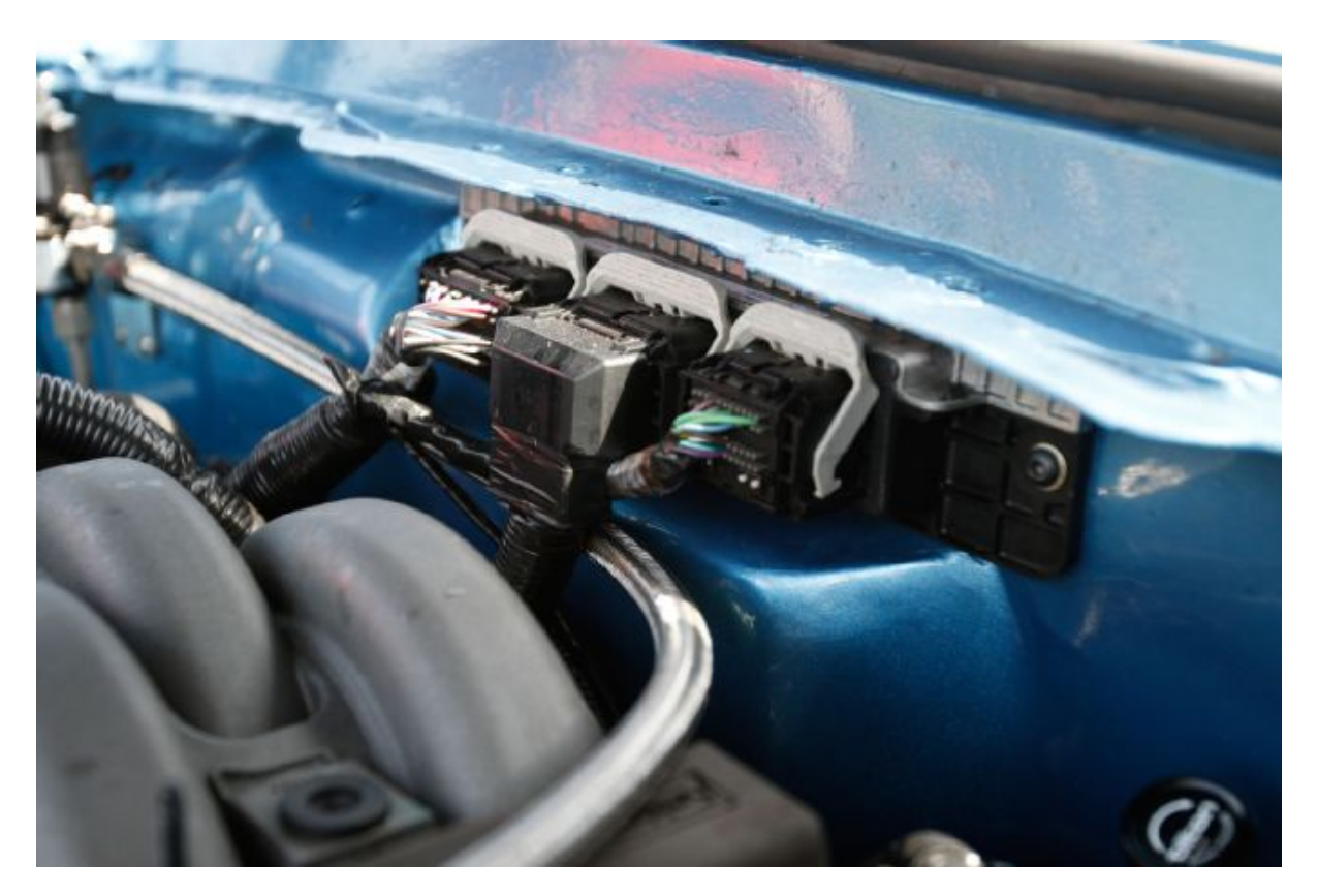
The Coyote is controlled with the Ford Performance Controls Pack.

Heidts' Project Shelby is also fitted with a Ford Performance 5.0L Coyote crate engine. And with 420hp, it's more than enough to motivate this pony.