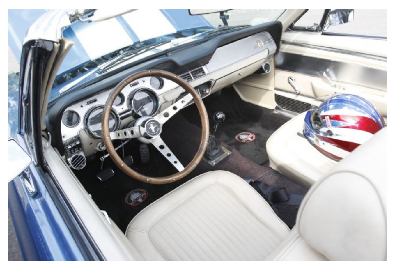
A factory steering wheel hides the Dakota Digital speedo and tachometer.