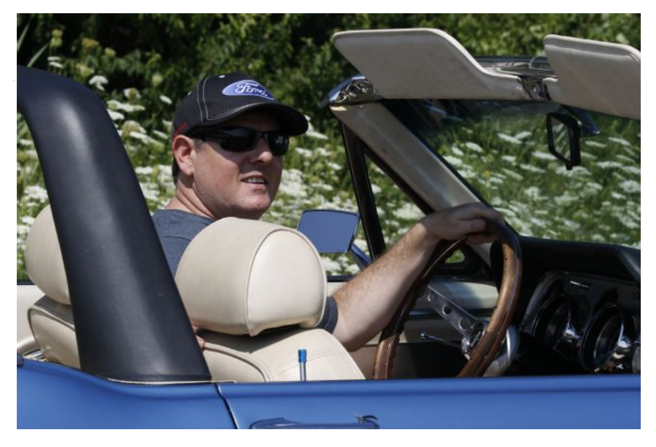
The author of the Heidts' Project Shelby sits at the wheel.