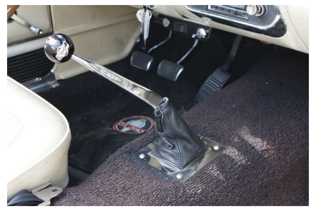
The Hurst handle is connected to a smooth-shifting Tremec six-speed.

With the body ready to go, BlackDog installed the complete Heidts front and rear suspension systems and the 5.0 Coyote engine, the complete custom exhaust, fuel system, cooling, and master cylinder, plus they custom-bent most of the lines and hoses. Bruce Couture of Modern Driveline assisted, fitting the Tremec six-speed and Quartermaster driveshaft in place. BlackDog mounted the Ford Controls Pack computer through the firewall, which added protection and a factory-like look. It set up the parameters of the ECU, and the Coyote was barking. "We cannot thank BlackDog enough for going above and beyond, ensuring a clean install and ultimate performance," Leyshon says.