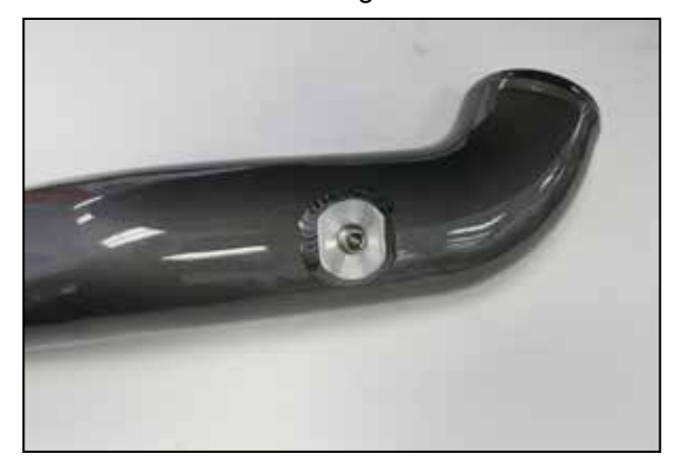
10. Apply thread sealant to the provided 1/8npt plug and then install the plug into the accessory port of the K&N cold side charge pipe.