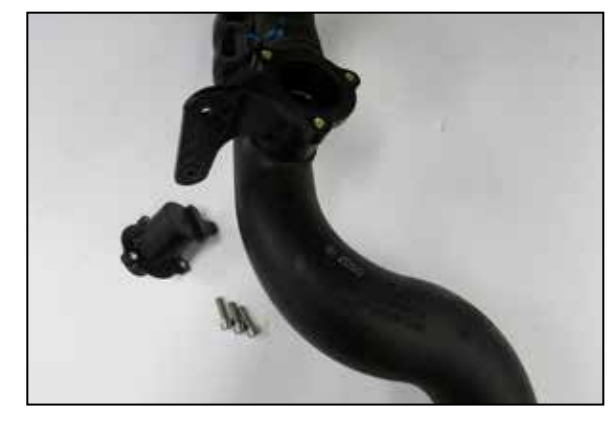
8. Remove the three bolts that secure the BOV to the factory charge tube and remove the valve from the tube. Release the spring clamp and disconnect the BOV hose from factory hot side charge tube