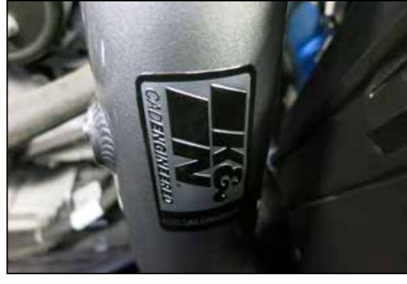
17. Apply the K&N decal to the K&N charge tube.