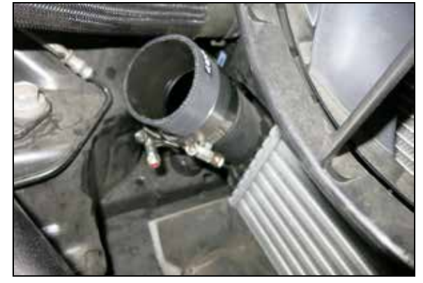
15. Install the provided step coupler onto the cold side of the inter cooler with the provide clamps, do not tighten.