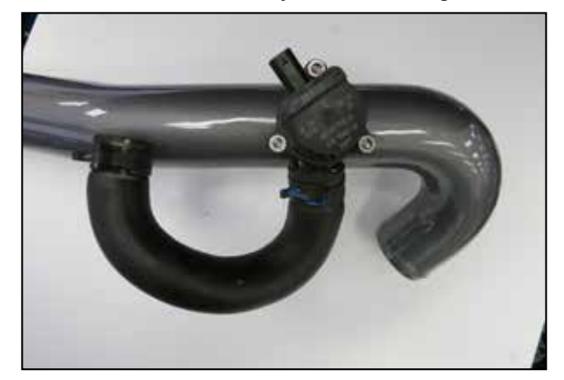
9. Install the BOV onto the K&N hot side charge tube and secure with the factory hardware removed in the previous step. Install the factory BOV hose onto the K&N hot side charge tube.