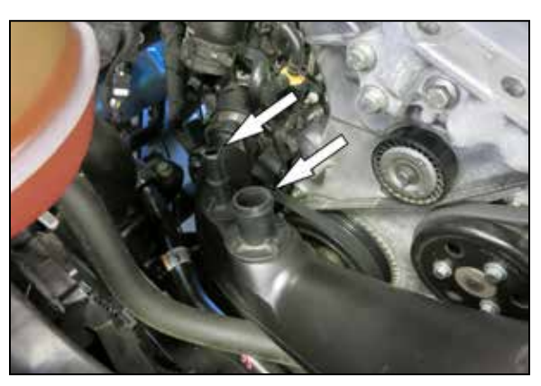
3. Release the spring clamp that secures the BOV hose to the intake tube and then disconnect the CCV line quick disconnect fitting from the intake tube.