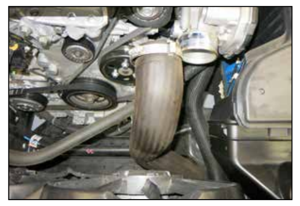
5. Loosen the hose clamps that secure cold side charge hose to the throttle body and inter cooler and then remove the cold side charge hose from the vehicle.

2. Loosen the hose clamp that secures the intake tube to the upper air filter housing and then release the clips that secure the upper housing to the lower housing.