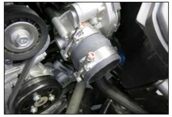
14. Install the provided hump coupler onto the throttle body with the provided clamps, do not tighten the clamps.

13. Install the K&N hot side charge tube into the couplers, align the tube for best fit and then tighten all the hose clamps. Reconnect the BOV electrical connection.