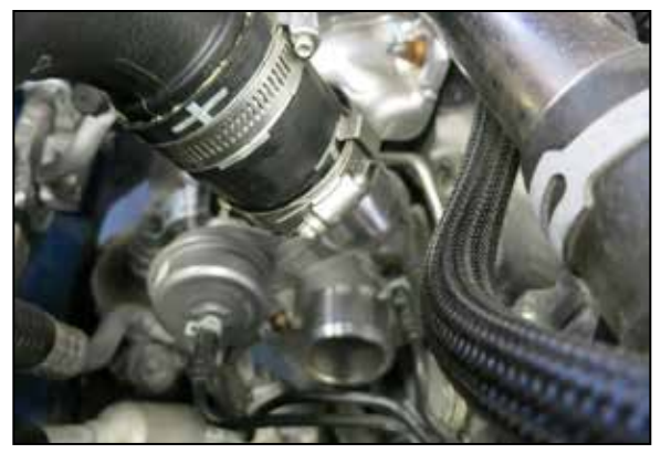
7. Loosen the hose clamps that secure the hot side charge tube to the turbo and intercooler and then remove the charge tube from the vehicle.