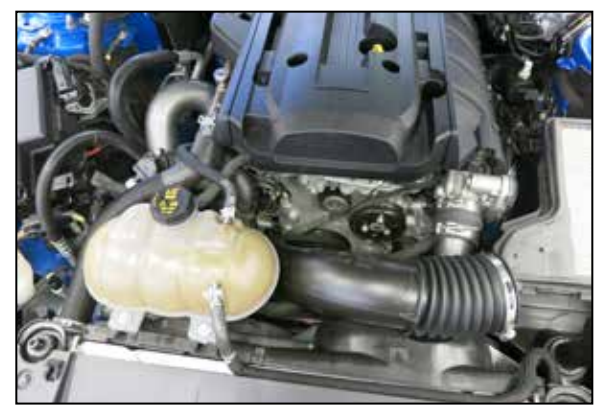
18. Reinstall the complete intake system and reconnect the factory BOV hose to the intake tube.