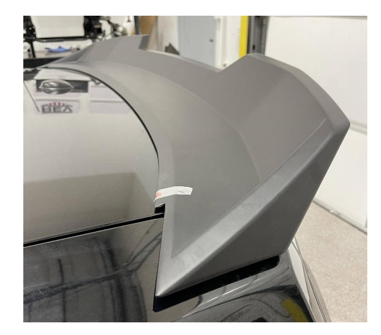
2. Install spoiler onto the trunk lid making sure all 4 threaded rods are protruding through the trunk lid.