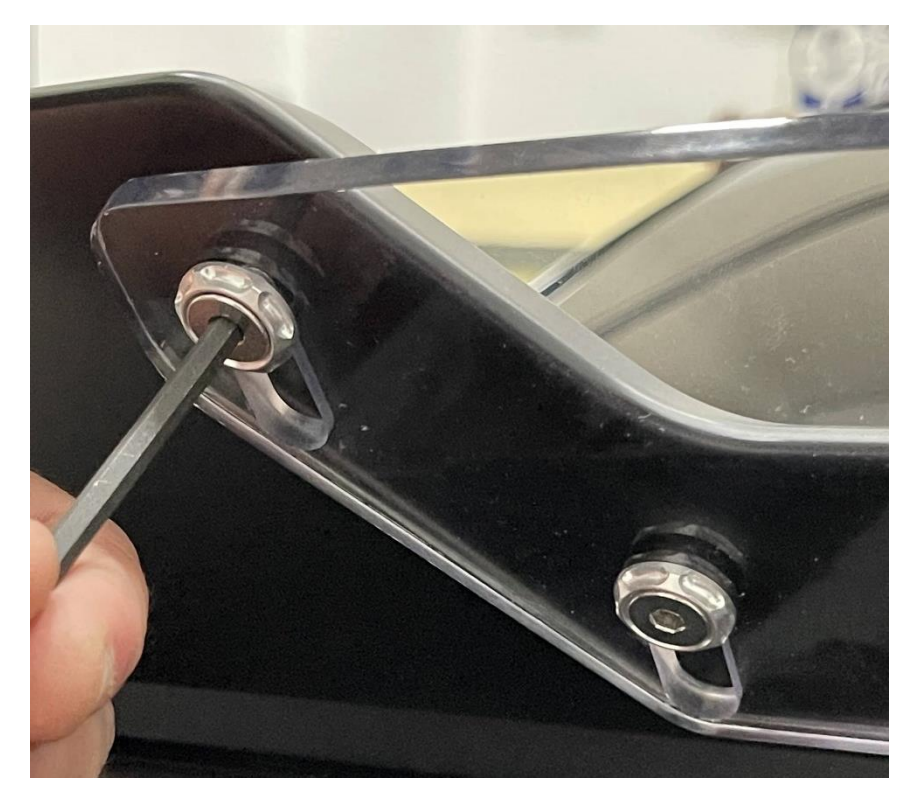
1. Install Lexan flap with (x6) billet washers and (x6) flat head screws as shown using a 4mm Allen wrench. Be sure not to overtighten.