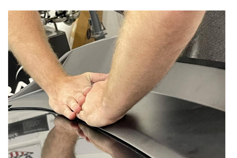
5. Push downward at multiple points on the front edge of the spoiler, pressing the tape into the trunk lid. Hold for a few seconds at each location for the tape to fully adhere.

4. Align the spoiler left to right so that the spacing is even on both ends.