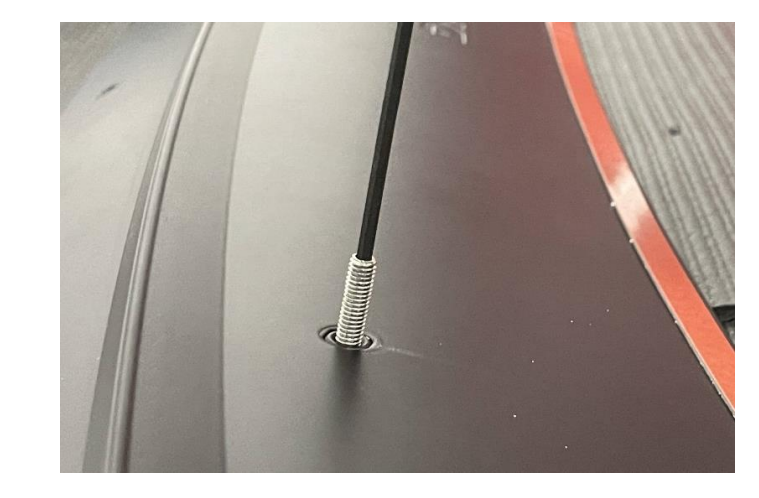
1. Apply Loctite and thread (x4) M6 threaded studs into spoiler using a 3mm Allen wrench, leaving the majority unthreaded as shown above.