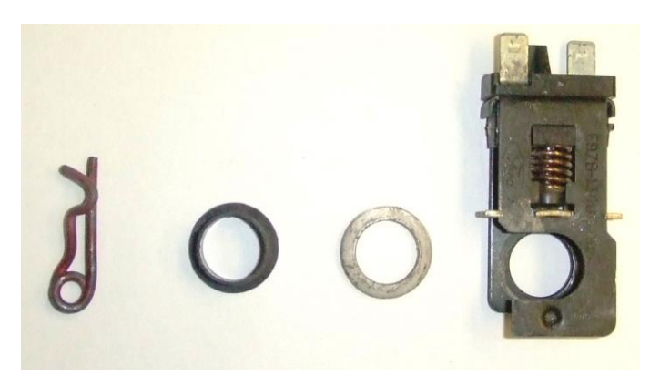
COTTER PIN, BUSHING, WASHER, & BRAKE LIGHT SWITCH