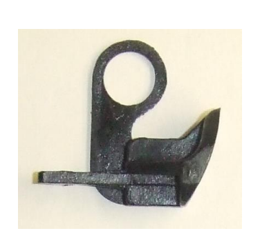
CRUISE CONTROL CANCELLATION BACKSTOP CLIP